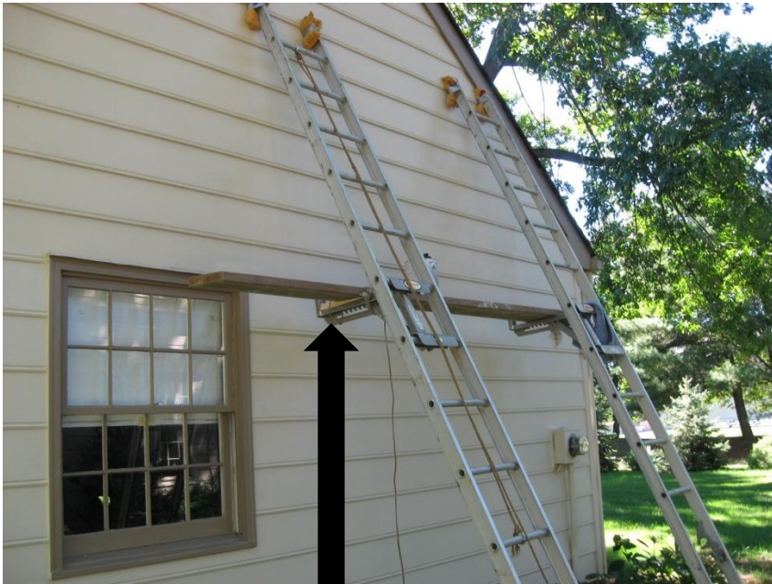
Ladder jacks and board