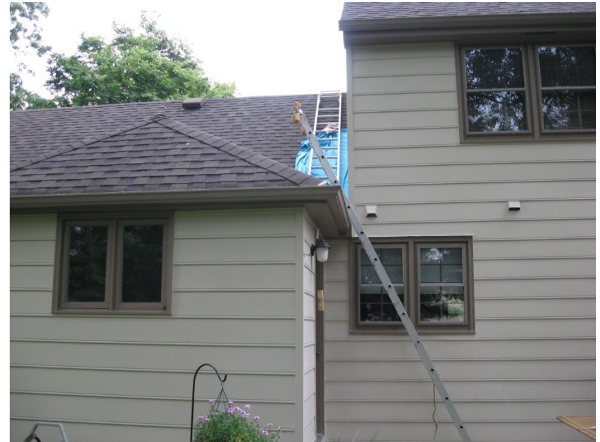
How ladder was used