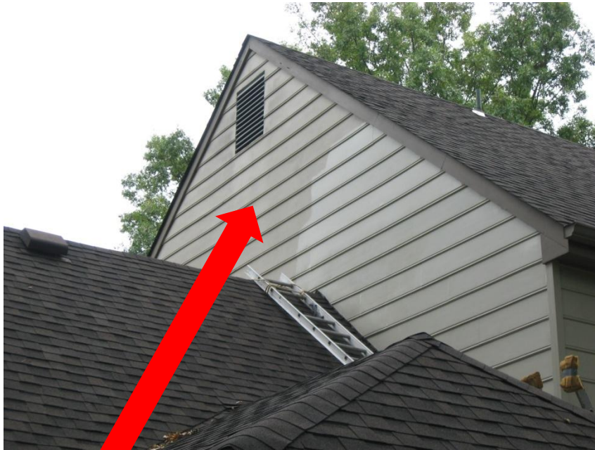
Dull part to be done from lift