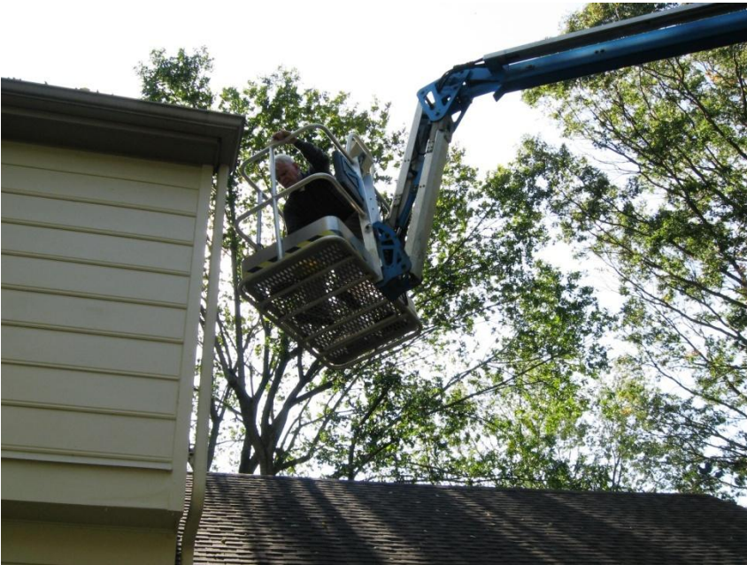
Shot from front of house