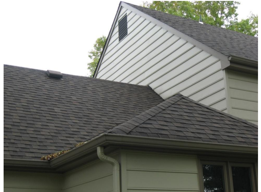
Finished look above garage